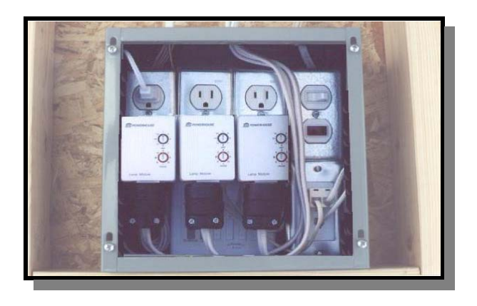
BEFORE (during construction)